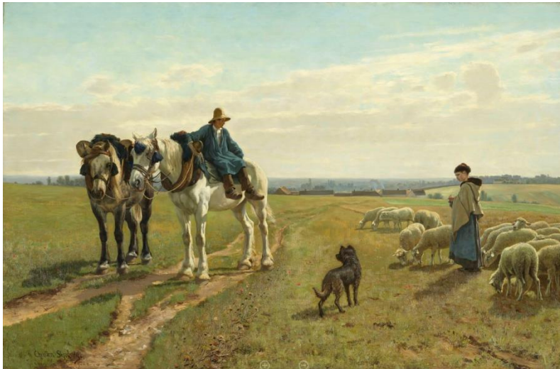
October morning in Grez by Christian Skredsvig, 1881-1882 - Norwegian National Museum, Oslo

Museum have allowed us to access letters from the painter, thereby shedding light on his stay in Marlotte.