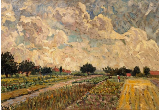
La plaine de Bourron près de Marlotte by Edvard Diriks, 1900