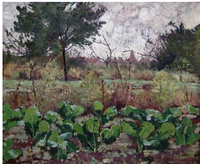
From Marlotte, France by Edvard Munch, 1908 – Oslo national gallery

Given the 22 years he spent in France and his affinity for naturalist and impressionist styles, it is no surprise that Diriks made a pilgrimage to the artistic hotspots of the Fontainebleau region, including Marlotte! He even left behind several canvases painted in our town, including the examples shown below. His reputation as a landscape dramatist and a painter of beautiful turquoise and silver skies, driven by the wind , is fully realized in two of the paintings below. These landscapes are studied by this man from the North with a heartfelt warmth, and always with that power, that robust nobility that he couldn't help but impose on everything he did. 10